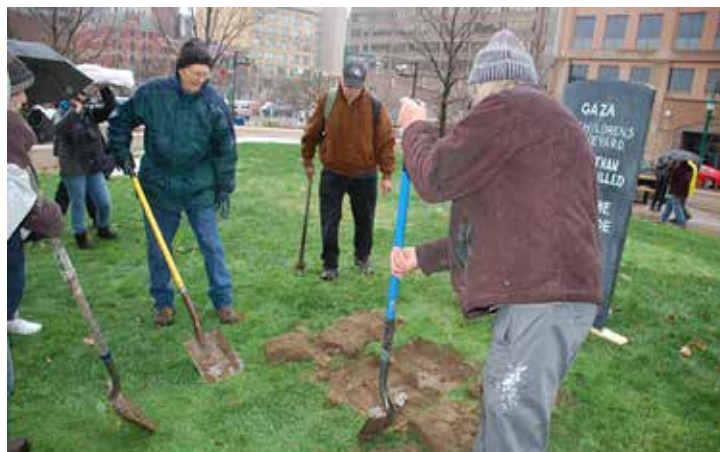
GRAVEDIGGING ACTION FOR GAZA CHILDREN, SYRACUSE, NY