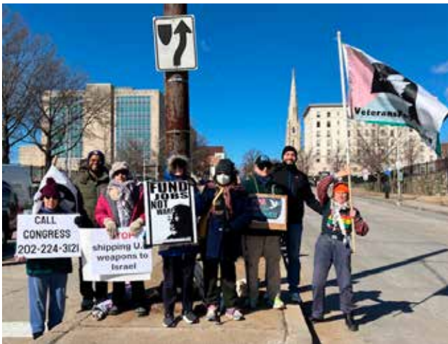
Baltimore VFP Chapter 105 and allies on a windy February 17.

In November 2024, our 18th annual Armistice Day event at Milwaukee City Hall drew a crowd of 90, plus others who joined via Zoom, to celebrate and promote peace.