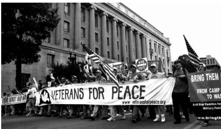
September 2005 Anti-Iraq War protest in D.C.