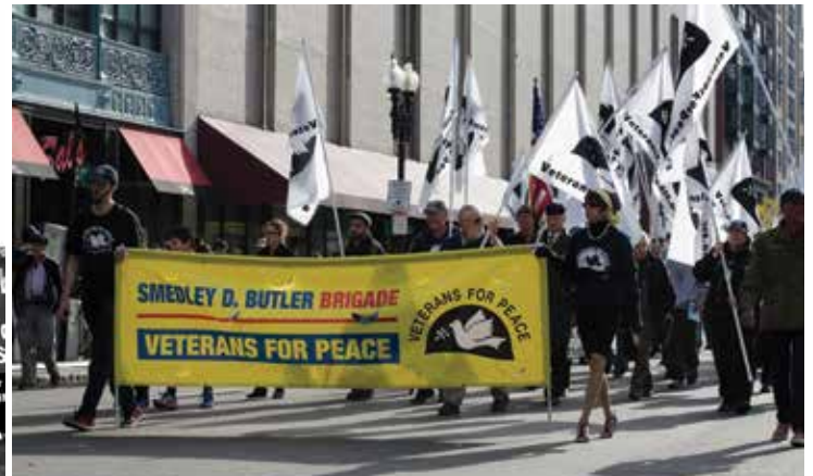
Boston's Smedley Butler Brigade, Armistice 2014