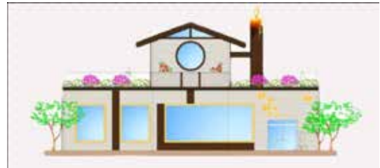
Memorial Archive Concept Illustration

For the past few years, the Hyosun-Miseon Peace Park Project Committee in Korea has been fundraising to build a Hyosun-Miseon Memorial Archive next to its peace park, in order to preserve the documents, pictures, and videos relating to the horrific deaths of the two girls and the subsequent Korean peoples' candlelight movement for justice. The archive will serve as an important peace education center where visitors may learn about the continuing human costs of the U.S.