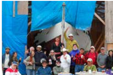
Restoration of the Golden Rule, 2011