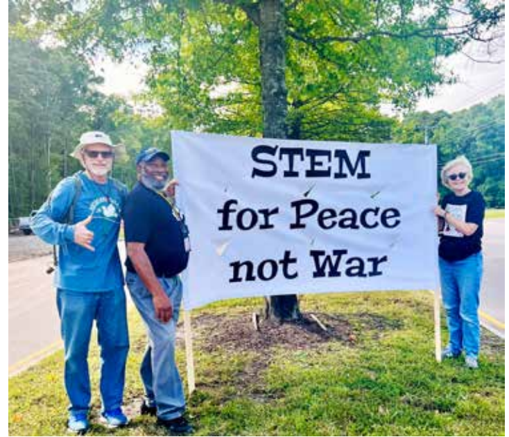
On Friday, September 20, NAS Oceana hosted a military career–focused STEM event for local Chesapeake and Virginia Beach 5th graders. Chapter 757 members held up signs for the school buses and got a lot of positive reactions from students, including peace signs flashed through tinted windows!