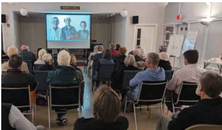
The Cape Code Chapter’s screening of What I Want You To Know attracted a good audience and spurred a great discussion.

The 30th Anniversary annual “Voices of Peace” Poetry Contest for 2025 has started. This contest, which is for both children and adults, has become a well-known and anticipated event in schools across Cape Cod and draws hundreds of