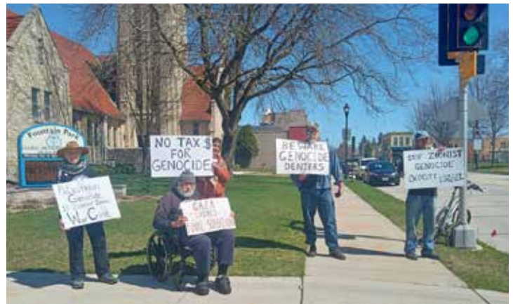
VFP Chapter 114: Showing up in Sheboygan