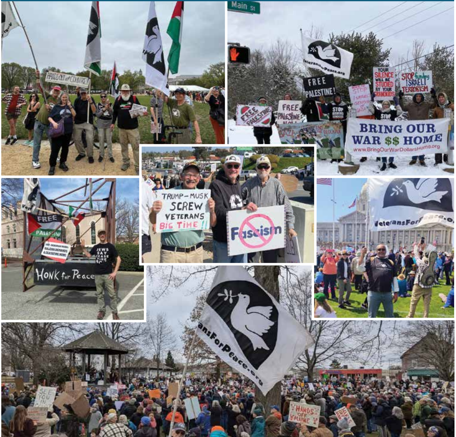
Veterans For Peace take a stand for FOR PEACE and AGAINST FASCISM at March and April STOP THE GENOCIDE and HANDS OFF! protests (clockwise from top left): Washington, DC; Topsham, ME; San Francisco; Brunswick, ME; Chapel Hill, NC; and (center) Encinitas, CA.