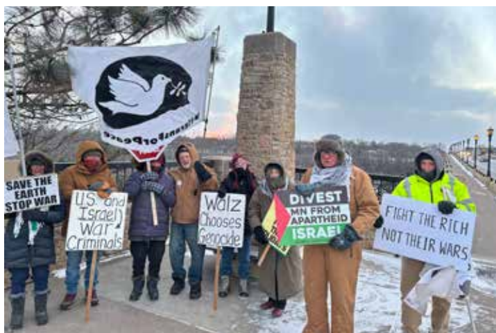
Members of Twin Cities VFP Chapter 27 join with friends from WAMM (Women Against Military Madness) for a visibility action on the Peace Bridge between Minneapolis and St Paul.