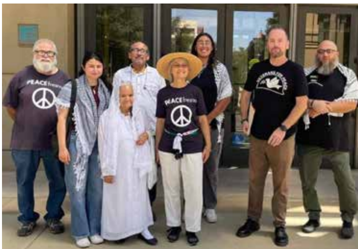
VFP Chapter 180 members and supporters gathered to demonstrate against the U.S.-Israeli genocide in Palestine, in October 2024.