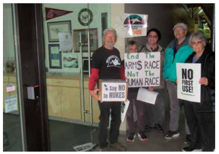
September 26, 2023—In solidarity with Defuse Nuclear War and the Washington Against Nuclear Weapons coalition (WANW), Chapter 35 members picketed at the Spokane office of Representative Cathy McMorris Rodgers.