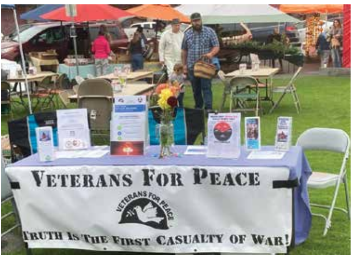
Chapter Reports continued on page 20