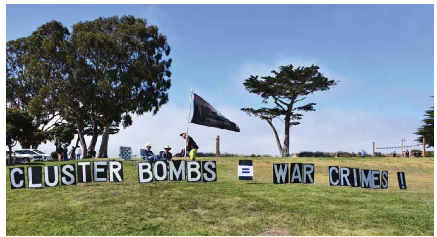
VFP Chapter 46 in Monterey, California, regularly organizes protests at Window on the Bay. This year, they actively protested the use of cluster bombs in Ukraine, emphasizing the need for humane warfare tactics and the protection of civilian lives.