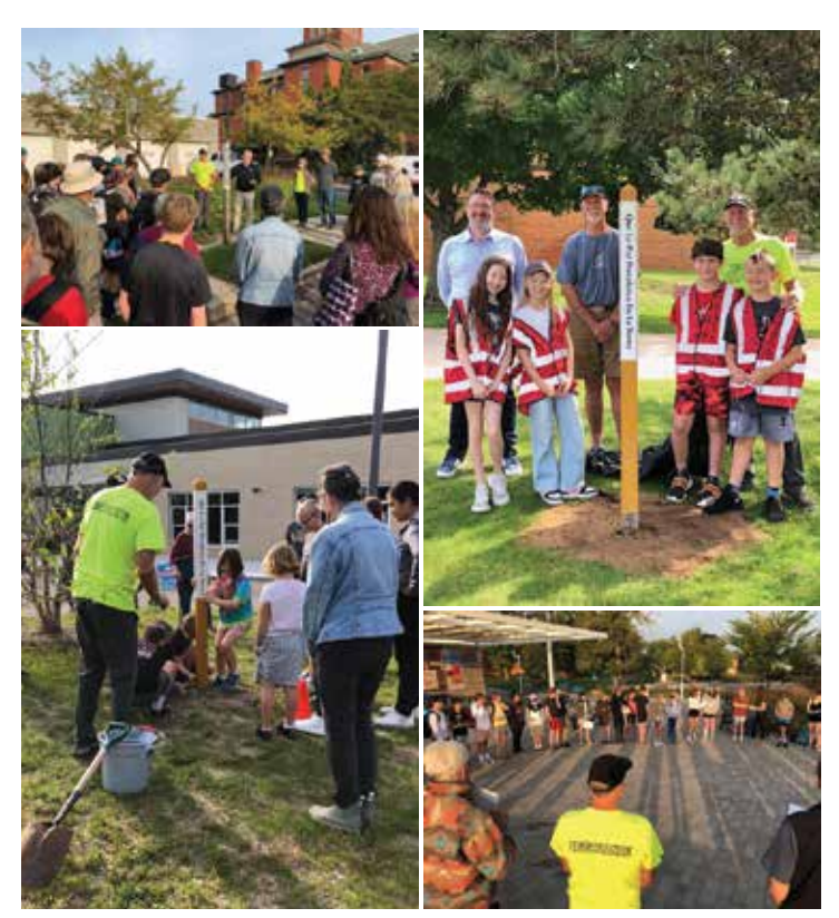
Traverse City, Northern Michigan, September 21, 2023—After beginning the day with a sunrise ceremony, VFP Chapter 50 celebrated the International Day of Peace by planting peace poles with students at five area elementary schools.