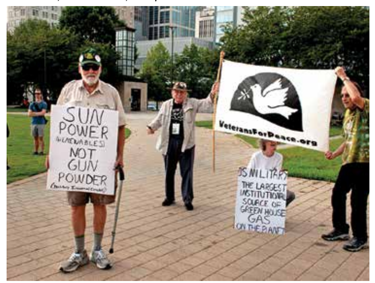
In September members of the Hector Black VFP Chapter 89 took part in a big climate rally in Nashville, Tennessee, drawing the connection between militarism and the climate crisis.

Nashville, Tennessee, Chapter 89 continued: