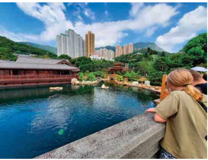
The ancient and the modern blend together in today's China.