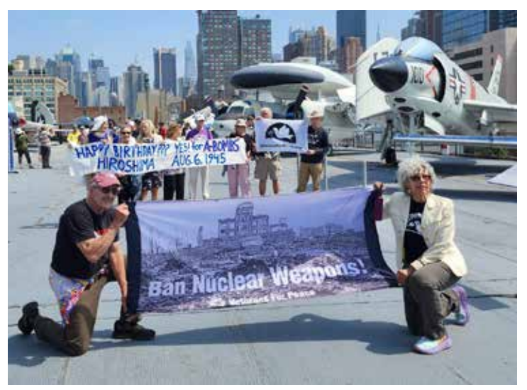
NYC Chapter 34 commemorates the atomic bombing of Hiroshima on August 6, 2023. Ellen Davidson also captured some great images of their banner drop from onboard the USS Intrepid Aircraft Carrier. See her photo album at: photos.app.goo.gl/En4dJsVyy4frFXx26

In-person events: Ceasefire in Gaza; Peace in Ukraine; Climate Crisis and Militarism; Korea reunification; demilitarizing