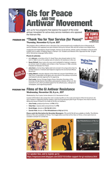
INFO & REGISTRATION