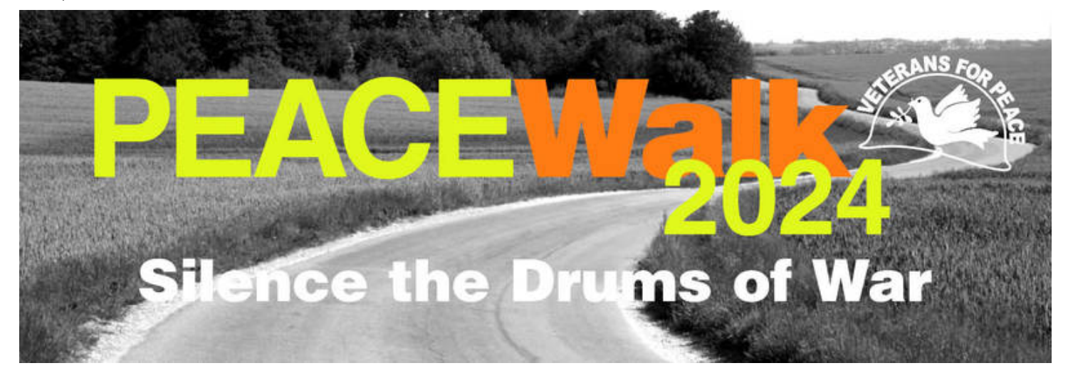
READ ALL ABOUT IT