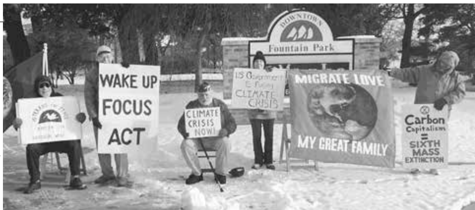
Members of Sheboygan, Wisconsin, Chapter 114 staged a Climate Crisis protest at the entrance to a local park last November.

wonderful buffet. We sang as we were graced by members of the Seattle Peace Chorus!