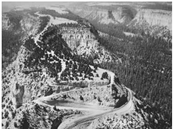
Aerial view of road to Los Alamos.

The Albuquerque and Santa Fe Chapters of Veterans For Peace were disappointed when plans for the 2021 VFP National Convention, to be held in Albuquerque, New Mexico, were put on hold due to COVID-19 pandemic quarantine orders. A few local planning committee members are now helping plan this year's virtual gathering. But the hotel and other bookings are secured for 2021, so please plan on gathering with us in Albuquerque and Los Alamos next year. The 70th and 71st anniversaries of the atomic bombings of Hiroshima and Nagasaki will be commemorated at the 2020 virtual and 2021 in-person VFP conventions respectively; other 2021 events to be announced as they are developed.