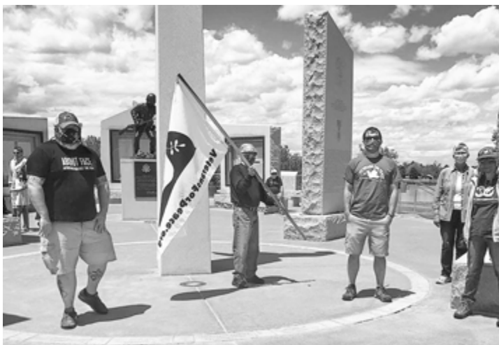
Members of Chapter 178 gathered at the Greeley Veterans Memorial at Bittersweet Park in Greeley, Colorado.