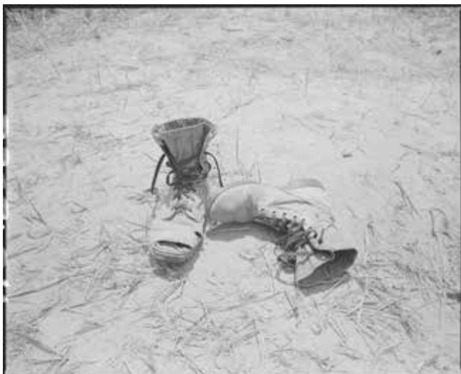
Viet Nam...Combat boots worn out in service, 23 May 1970.