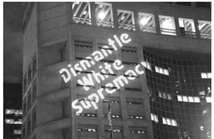
Mike Hastie captured a photo of this projection at a demonstration on June 20 at the Justice Center in downtown Portland, Oregon..