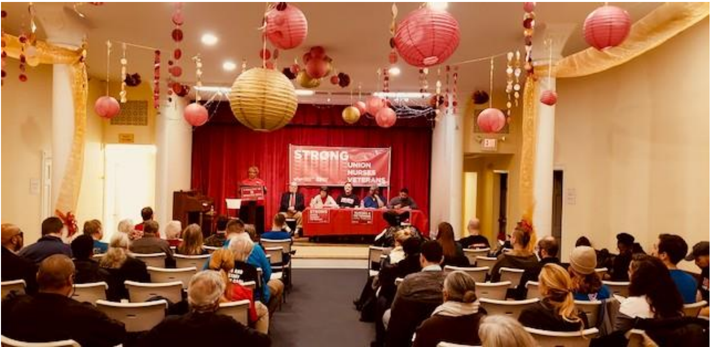
Over 70 people attended the Town Hall including a contingent of NNU nurses from the Washington VA Hospital.

SAVE THE VA TOWN HALL: A HEALTHY VA MEANS HEALTHY VETS Tuesday evening National Nurses United, a VA union, sponsored a Town Hall at the Capitol Hill Presbyterian Church where the SOVA Conference was based. It was a high-energy event and a welcome evening after returning from our first day of lobbying on the Hill.