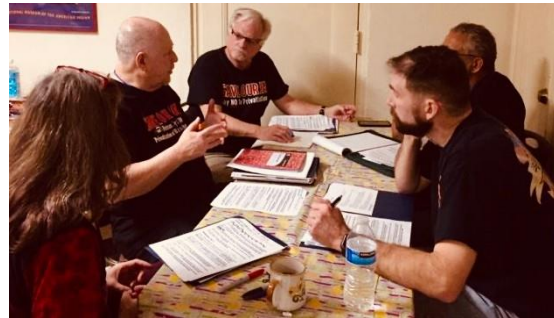
Lobbying Teams 2 & 4 Preparing for Lobbying

LOBBYING MEMBERS OF CONGRESS: Tuesday afternoon, Feb 11, and Wednesday, Feb 12, were devoted to lobbying Members of Congress (MOC). We concentrated on House members. We had meetings with 11 Conference participants' MOC and 22 (13 Democrats & 9 Republicans) members of the House Committee on Veterans Affairs. Our message to all was to Stop Privatization of VA Healthcare and become Co-Sponsors of H.Res.701 Expressing support for policies that maintain a robust, fully funded and staffed Veterans Health Administration of the Department of Veterans Affairs and do not jeopardize care for veterans by moving essential resources to the for-profit private sector.