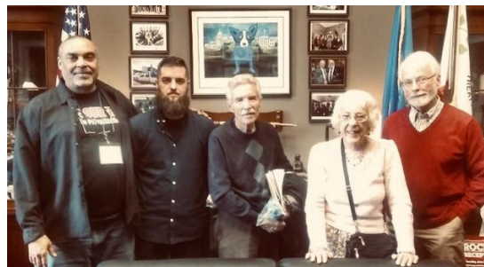
Lobbying Team 1 Inside a MOC's Office