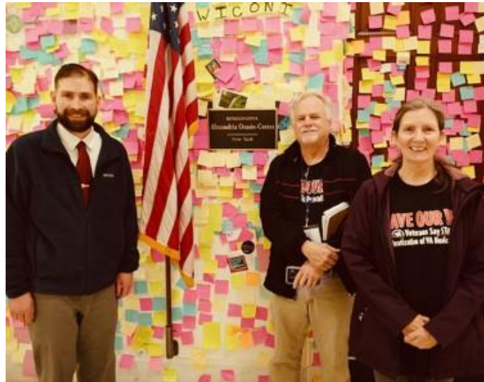
Lobbying Team 4 Outside Rep Alexandria-Ocasio's Office Where the Wall is Covered With Post-Its From Well-Wishers

TWO MOC BECOME CO-SPONSORS OF HR 701 When we arrived in Washington for the SOVA Conference, HR 701 had 8 Co-Sponsors, all from Nov and Dec, 2019. Before we left Washington, two members of the House became Co-Sponsors. First was Rep Alexandria Ocasio-Cortez (D-NY, 14 th ) who was not able to meet with us but agreed to become a Co-Sponsor on Feb 10. She was followed by Rep Adriano Espaillat (D-NY, 17 th ) . Team 2 met with his staff member on Feb 12