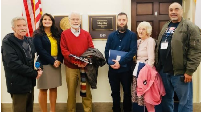
Lobbying Team 1 After Meeting Rep Chip Roy