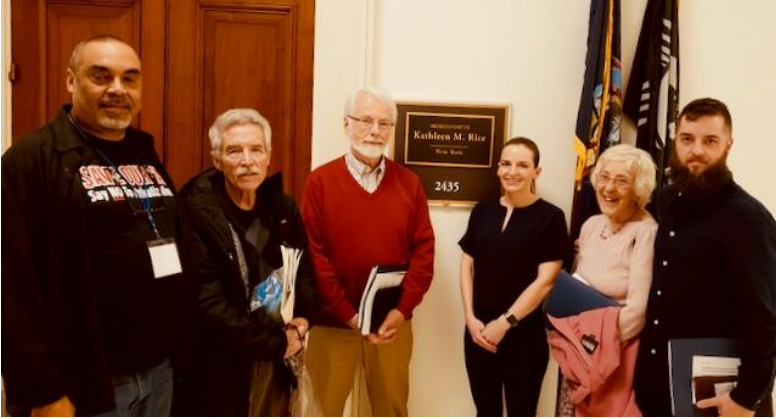
Lobbying Team 1 After Meeting With the Staff of Rep Rice

ALL DAY LOBBYING ON WEDNESDAY, FEB 12: Our 3 Lobbying Teams returned to a full-day in the House Office Buildings (Canon, Longworth, Rayburn) meeting with MOC or their aides.