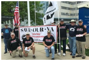
Jamaica Plains, MA