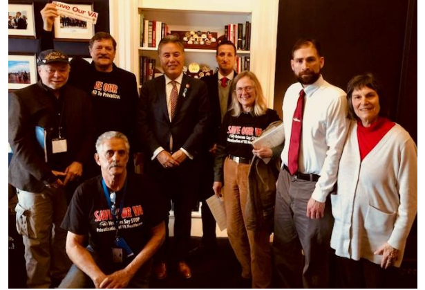
Lobbying Team 2 Meeting With Rep Mark Takano, Chairman of the House CVA

TWO MOC BECOME CO-SPONSORS OF HR 701 When we arrived in Washington for the SOVA Conference, HR 701 had 8 Co-Sponsors, all from Nov and Dec, 2019. Before we left Washington, two members of the House became Co-Sponsors. First was Rep Alexandria Ocasio-Cortez (D-NY, 14 th ) who was not able to meet with us but agreed to become a Co-Sponsor on Feb 10. She was followed by Rep Adriano Espaillat (D-NY, 17 th ) . Team 2 met with his staff member on Feb 12