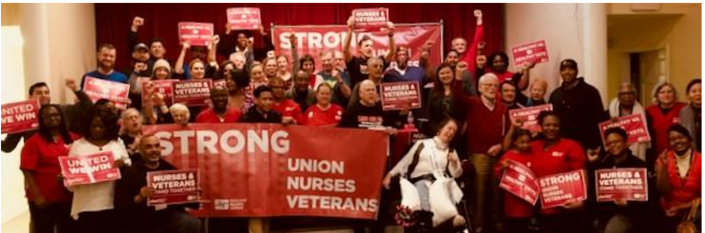
After the Town Hall ended, everyone came to the front for a group photo.