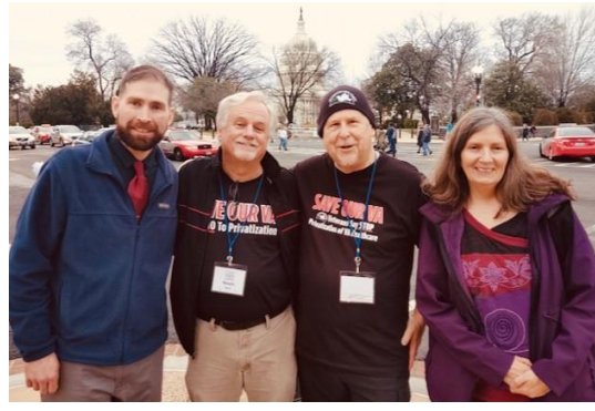
Lobbying Team 4 Outside the House Building

WE HAD MEETINGS WITH 11 CONFERENCE PARTICIPANTS' MOC: Before coming to Washington, many Conference participants scheduled meetings with their own MOC and we met with of them: Rep Earl Blumenauer (D-Or, 3 rd ), Rep Suzanne Bonamici (D-Or, 1 st ), Rep. Jim Costa (D-CA, 16 th ), Rep. Peter DeFazio (D-OR, 4 th ), Rep Adriano Espaillat (D-NY, 17 th ), Rep Deb Haaland (D-NM, 1 st ), Representative Carolyn B. Maloney (D- NY, 12 th ), Rep Mark Meadows (R-NC, 11 th ), Rep Joseph Morelle (D-NY, 25 th ), Rep Denver Riggleman (R-VA 5 th ), Rep Emily Ann Wagner (R-MO, 2 nd )