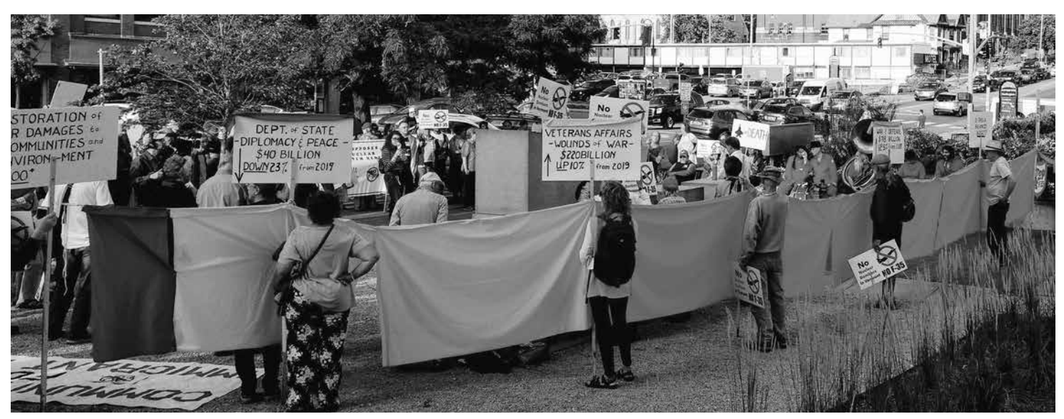
Green Mountain Chapter members displayed their 50-foot-long "Budget Banner" in a September 6th rally to protest the F-35. The banner uses different colors to represent proportionally the 2019 budgets for the Department of Defense, the Veterans Administration, and the State Department. The budget for restoration of damages to communities and environment is minuscule in comparison (too small to show).