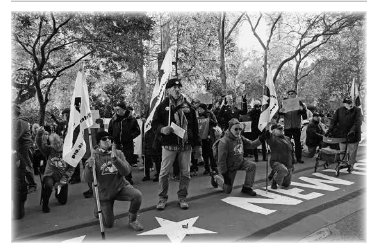
Members of New York City Chapter 34 take a knee at the NYC Armistice Day Parade reviewing stand.

Chapter 34, honored for its activism with the Chapter of the Year award at the 2018 VFP National Convention, continues to be very active, keeping up VFP presence at rallies, demonstrations, and educational events regarding continuing U.S. military involvement in Yemen, Iran, North Korea, and Afghanistan, and coordinating with other peace groups, including CODEPINK,