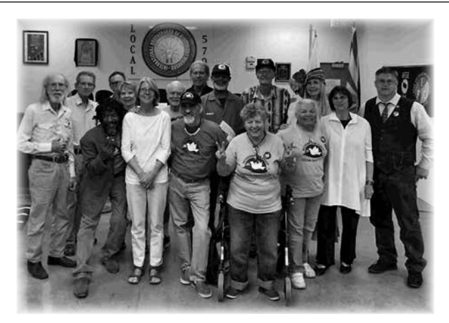
The Tucson Chapter sends greetings!

Since the 2017 VFP International Convention in Chicago, Chapter 13 has taken "Peace at Home, Peace Abroad" to heart. From "Say NO to VA Privatization" to the SOAW Border Encuentro in Nogales, Sonora/Arizona, to the ongoing support for refugees along the border, we continue to expose the true costs of war and war's futility. We participate in vigils against war at Speedway's recruitment center, against manufactured