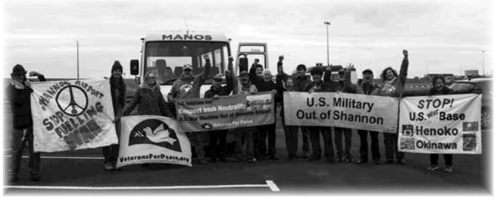
Veterans For Peace members from the USA and Ireland staged a protest at Shannon Airport on November 19, 2018.