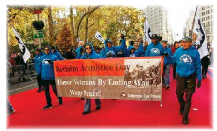
Read all about it on pages 6–7, and in the Chapter Reports.

how bad things get. Seguiré siendo humano.