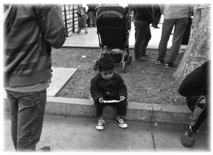
A boy waits patiently for his family's number to be called a wait that could go on for months.

more problems than we solved, which is something you need to consider when you don't have enough for everyone.