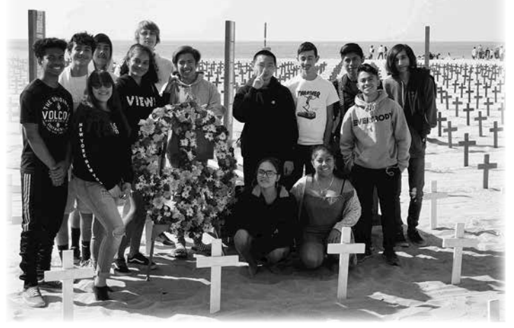
Santa Monica Beach, California—One group of the many high school students who volunteered with VFP-Los Angeles Chapter 7 to help set up the Arlington West Memorial on Armistice Day this year. These students also made the wreath in the picture.

On Armistice Day we stood at Monument Square with VFP flags flowing as the so-called parade passed. Our "Reclaim