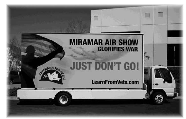
Chapter 91 published a mobile billboard to publicize its Miramar Air Show boycott campaign, which serves to educate the public about the harmful effects of glorifying war.

The summer and fall of 2018 found San Diego Chapter 91 very active in many ways. We marked our third year educating the public here not to attend the annual Miramar Air Show in September by bannering over the I-15 each Thursday during July, August, and September, getting press coverage and purchasing a mobile billboard, after being unable to buy a commercial billboard in this military-friendly town.