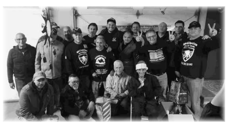
Sent as a Christmas greeting from Unified U.S. Deported Veterans Resource Center/VFP Sgt. Barrios Memorial Chapter #182: "May 2019 bring the joy of Peace and Justice we all seek."

U.S. Deported Veterans vow to continue to serve, in the true