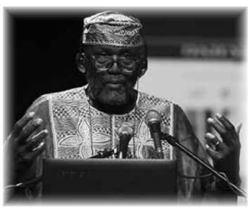
Ajamu Baraka, Black Alliance for Peace, U.S.