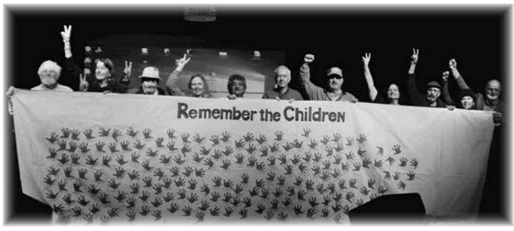
VFP members from the USA, Ireland, and the U.K. show off an art banner commemorating children killed in wars, at the International Conference Against U.S./NATO Military Bases held in Dublin, Ireland, on November 18, 2018.