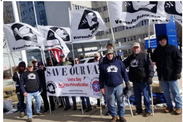
Boston Vets Show Their Support for the Jamaica Plains VA, Feb. 2018

The VHA provides a fully-integrated healthcare delivery system serving 9 million veterans. Primary care is organized around teams of physicians, nurses and other healthcare professionals who work together in collaboration and complementary ways to meet the needs of their veteran patients. Teams treat each veteran, who often have unique sets of injuries and disabilities, in a holistic, whole person manner, rather than a collage of disparate clinical conditions like patients in the private sector healthcare system. Such coordination of patients' care into the VHA's interconnected programs and support services is why 80% of veterans rate VA healthcare services as equal to or better than private sector healthcare facilities. Genuine integration affords veterans a level of care unavailable to most Americans, who remain subject to our fragmented private sector healthcare system.