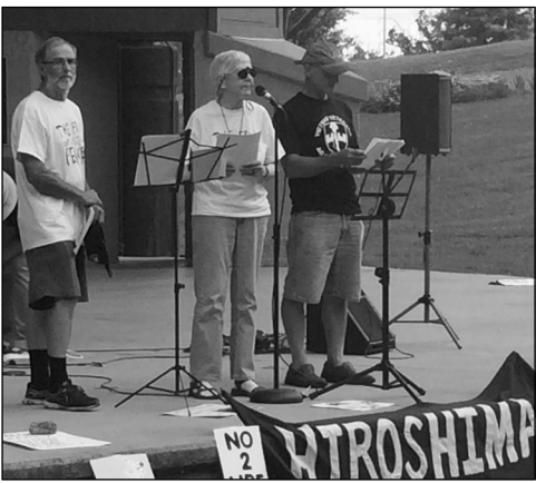
Ch. 89 members attended Oak Ridge Hiroshima commemoration.

march to Y-12 included people from around the USA and ages from 85 (Sister Megan) to babies in strollers. We lined up across from the fence enclosing the plant, sang songs and advanced in unison to tie peace cranes to the fence.