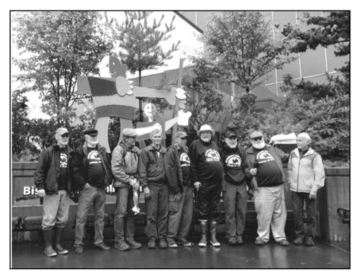
Members of Ch. 100 with sculpture, GROWING PEACE

Kenny Memorial Peace Park (the park itself was dedicated in September 2012). The colorful, whimsical, even "cartoonish" sculpture portrays an adult with a hoe and a child holding a piece of bread; it is named GROWING PEACE. The statue was designed by long-time Juneau artist Jim Fowler and was funded by VFP, with assistance from other members of the Juneau Peace Community and the Alaska-based Rasmuson Foundation. The dedication was attended by over 100 Juneau citizens, including the Mayor of Juneau, who accepted the sculpture on behalf of the city.