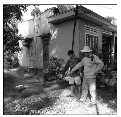
Project RENEW staff in the field.

to come back to a fundamental point: the 15,000 victims of Agent Orange in Quang Tri and their families who would be targeted for help and support in their homes, primarily, where their needs are greatest, simply have nowhere else to turn