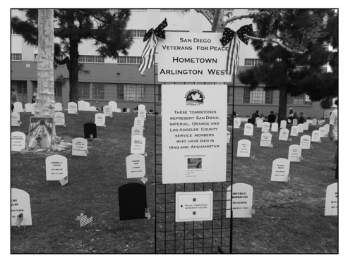
Ch. 91's Hometown Arlington display, November 2014

and we have been both rejuvenated and inspired often by our younger post-9/11 veteran members.