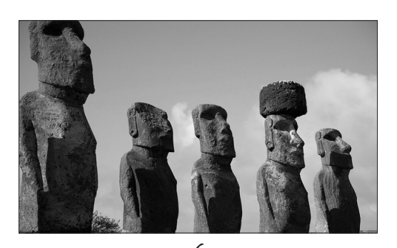
<u>6</u> THOU SHALT NOT THREATEN TO DESTROY CIVILIZATION.