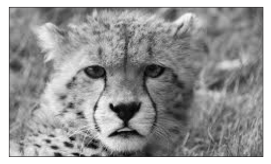
\frac{7}{\text{THOU SHALT NOT ABANDON STEWARDSHIP}} OF FISH AND FOWL, BIRDS AND BEASTS.