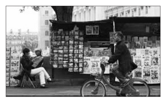
THOU SHALT NOT HOLD HOSTAGE CITIES AND THEIR INHABITANTS.