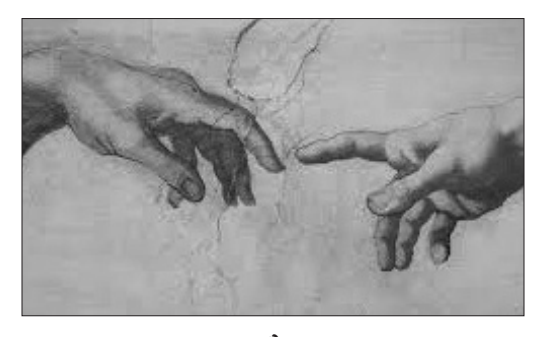
\frac{\underline{8}}{\text{THOU SHALT NOT PUT ALL OF CREATION}} AT RISK OF ANNIHILATION.