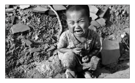
2 THOU SHALT NOT THREATEN TO SLAUGHTER THE INNOCENT.