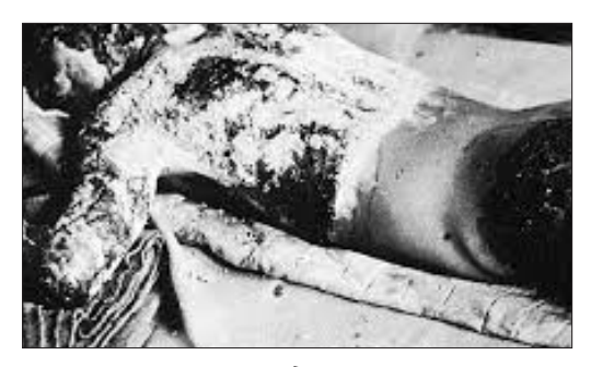
3 THOU SHALT NOT CAUSE UNNECESSARY SUFFERING.