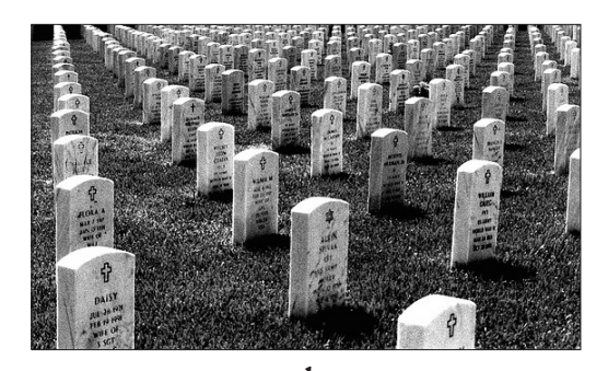
\frac{l}{l} THOU SHALT NOT KILL.