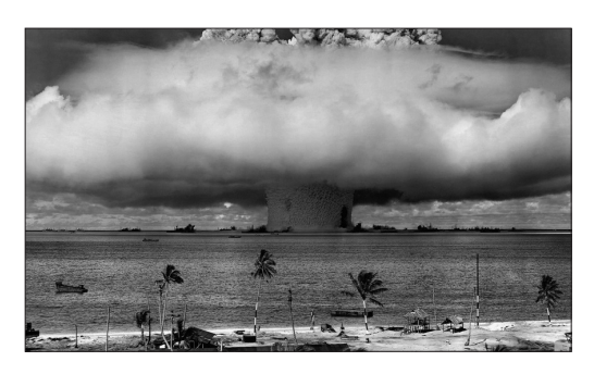
9 THOU SHALT NOT USE WEAPONS THAT CANNOT BE CONTAINED IN SPACE OR TIME.