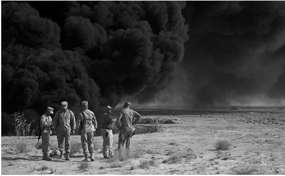
The US military is the world's biggest polluter.