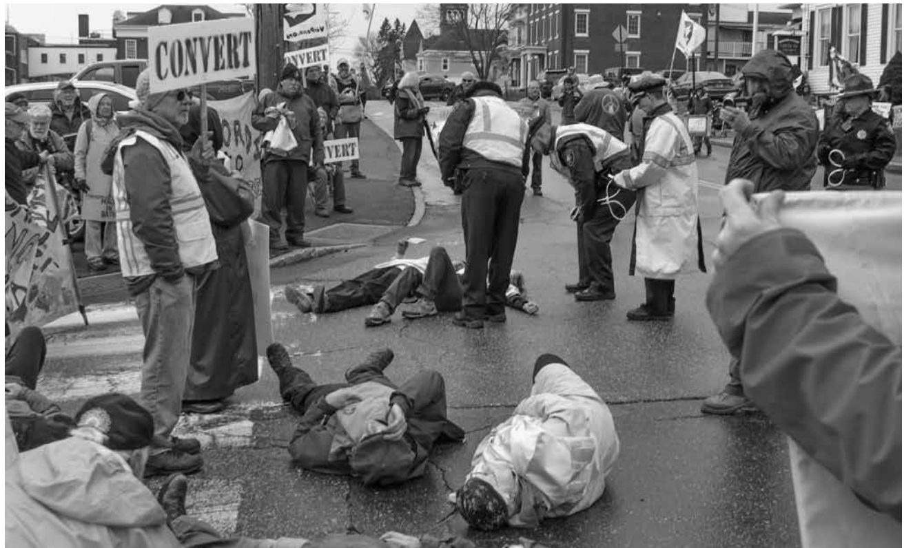
Activists get arrested outside Bath Iron Works April 27.

A person doesn't oppose the U.S. military in this country to win a popularity contest. The Pentagon has spent billions over the years successfully propagandizing about the greatest country in the world defended by the greatest army in the world, that our “way of life” is secured by our vast and far-flung weaponry. Even politicians, who lament that we can't seem to find enough money for education, health care, repairing infrastructure, fighting poverty, and protecting the environment, are afraid to mention that nearly 60% of our discretionary funds go to the military. And they are certainly afraid to point out the obvious: U.S. militarism is more about business, about profit for the defense contractors,