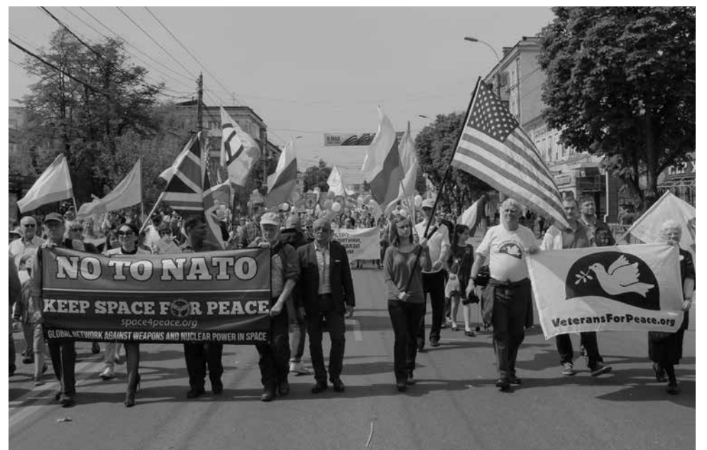
Delegation members march on Victory Day in St. Petersburg May 9.

The Russian people love their country with a warmth and depth of love that is difficult for Americans to comprehend. It is a love born of centuries of history, culture and religious faith, and a love born of the suffering and sacrifice of the repeated