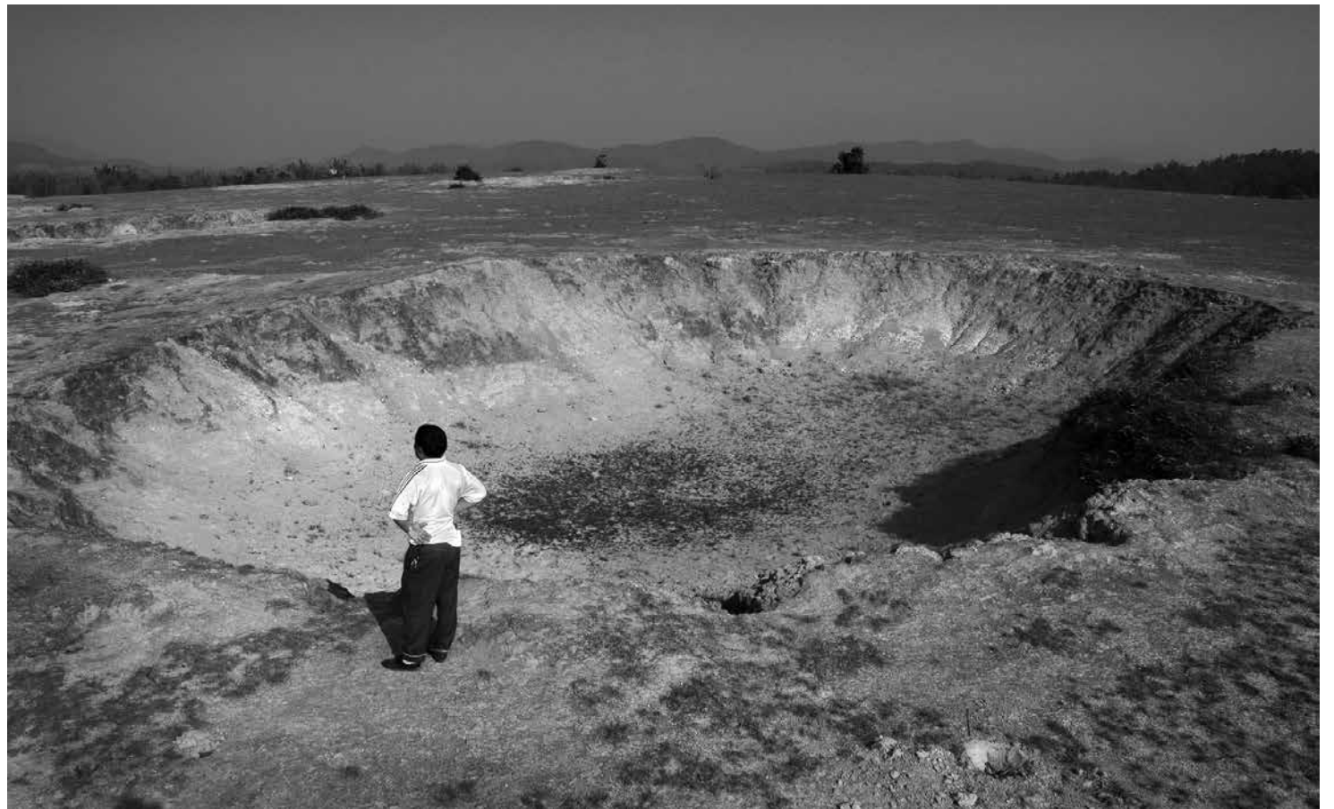
Crater from U.S. bombing in Laos during the Viet Nam War.

Who knew about this? The people of Laos and North Vietnam and China and those of us doing it did. Who didn't know was all of the people in the United States. What harm would have been done to tell the American people what we were doing? Well, it might have taken some of the sheen off the apple pie myth about who we are as a country. As a person who worked on targets in Laos, I can tell you the bomb-