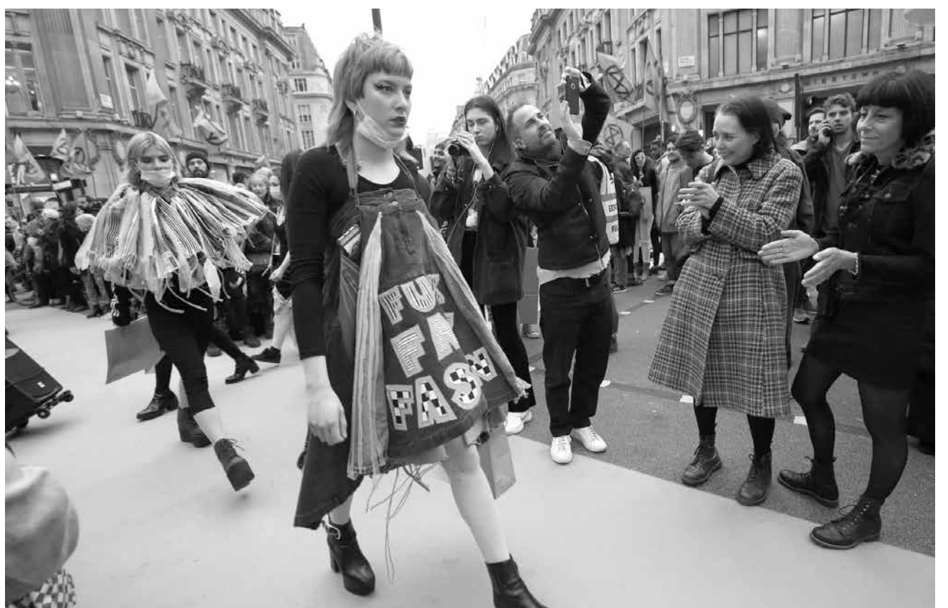
Extinction Rebellion's Fashion: Circus of Excess event in London, a protest against disposable and wasteful fashion.