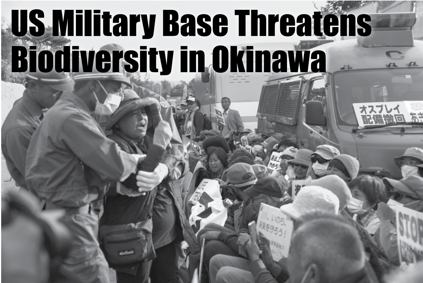
Police remove Okinawan activists blocking the construction gates at Henoko.