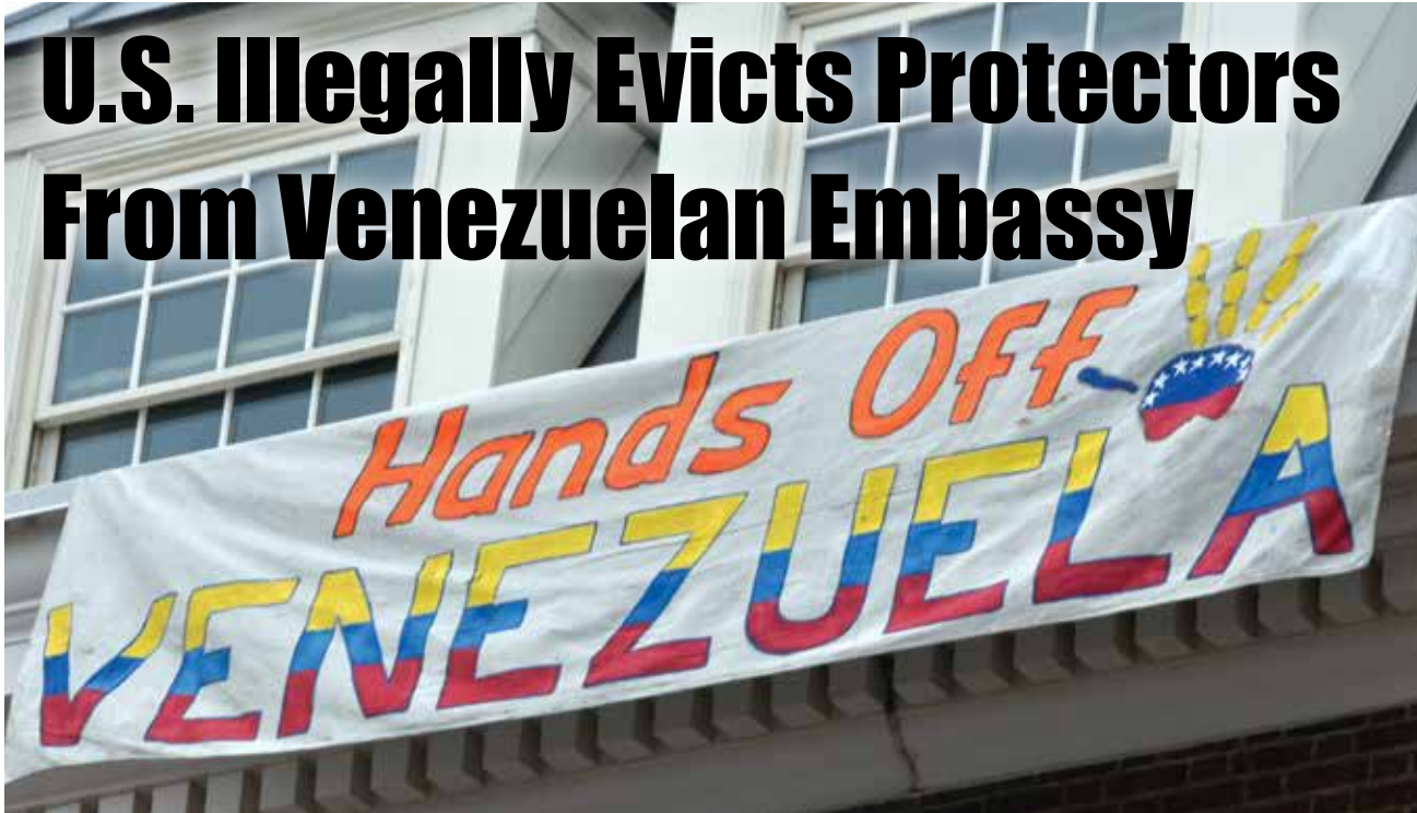
Banner outside the Venezuelan Embassy May 11.