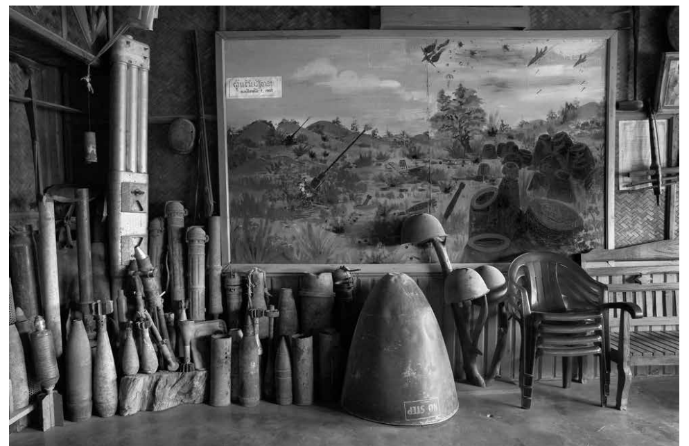
Lobby of the Vinh Thong Guesthouse in Phonsavan town, Laos.

After tech school and that first leave, I went to a Strategic Air Command airbase. I was cleared for Top Secret Extremely Sensitive Information, Single Integrated Operations Plan, Crypto Access and worked in the Intelligence vault on the war plan to nuke the Soviet Union. We had a contingency plan on Cuba, and I knew but did not see the plans we had on our allies. (That will be redacted, as other pieces of this essay will be, when it falls into official hands.) Bombers and crewmembers were ready to go at a moment's notice. It went on for years. Some crewmembers spent their career on alert. Less considered by people not on a bomber crew or working on the war plan was where the bombers went after they dropped their nukes. Since we still have a nuclear force that includes bombers, this may still be classified but here it is. When I worked on the war plan, in '64 and