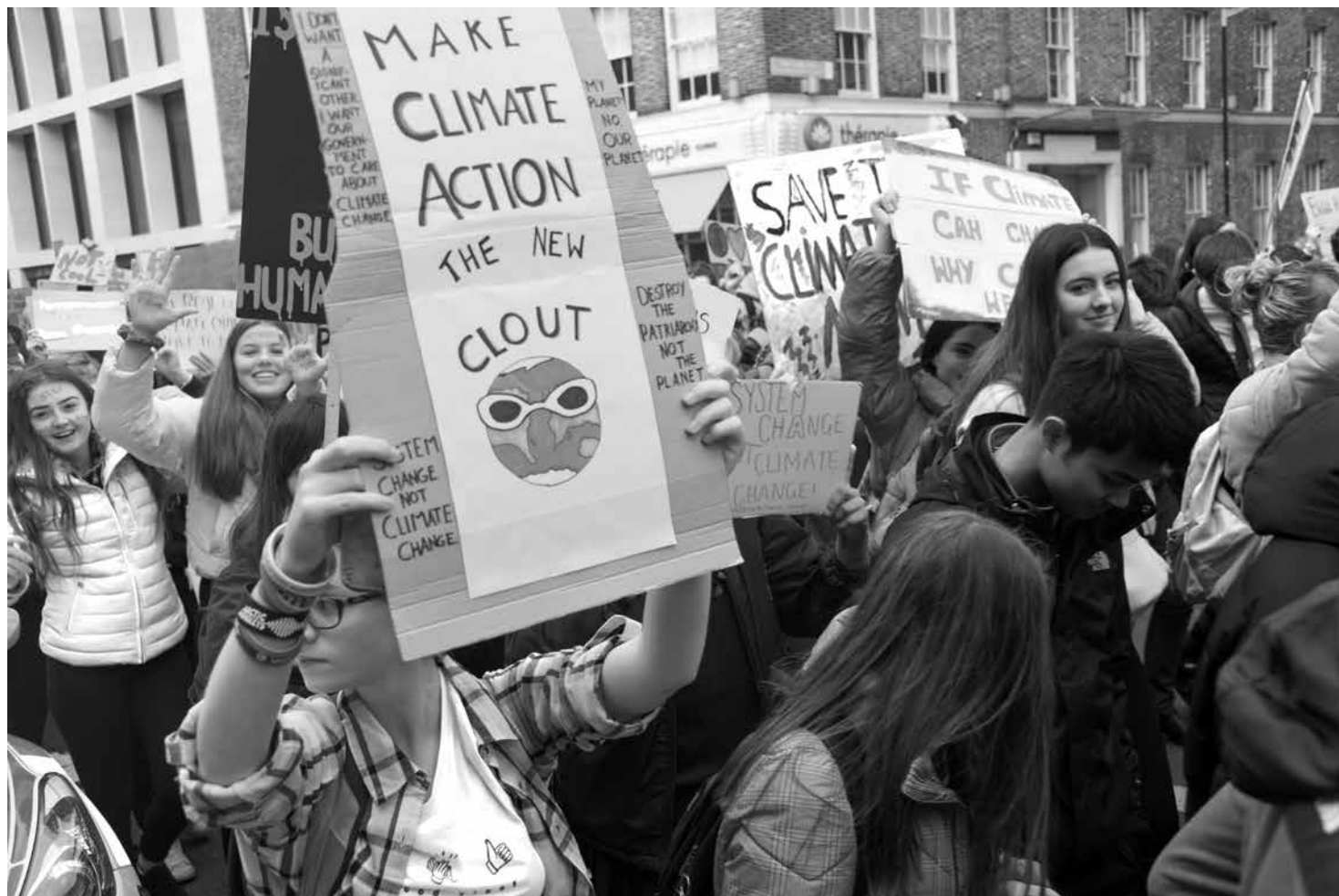
Students in Dublin join worldwide school strike for climate change March 16.

And please note that those numbers don't