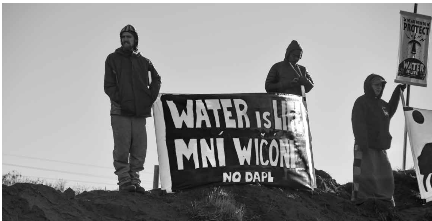
Water protectors at Standing Rock, N.D. in October 2017.