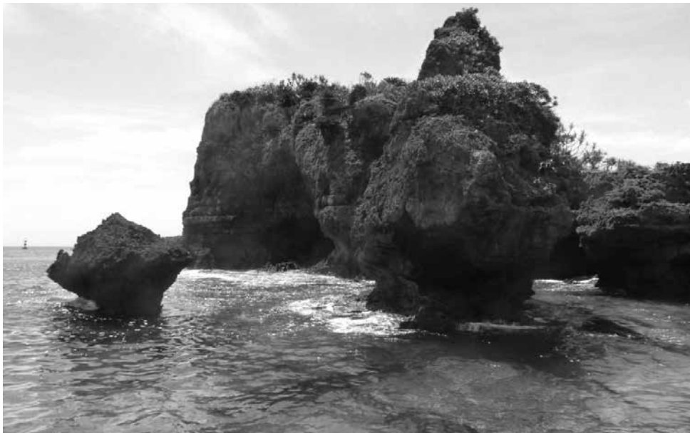
Plant-topped mountains rise from the ocean: Rare geologic formations in the limestone caverns of Nagashima, a small island off Cape Henoko, are but one of a number of ecosystems that environmentalists are fighting to protect from new military construction in Oura Bay.

With seawall construction under way, Masucci said that where seawater had been contained for months, lower water quality has led to the growth of nutrients, producing seaweed and algae that compete with coral.