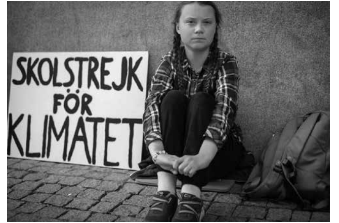
Greta Thunberg, outside the Swedish parliament in 2018.

They are desperate to remove the focus from the climate crisis and change the subject. They don't want to