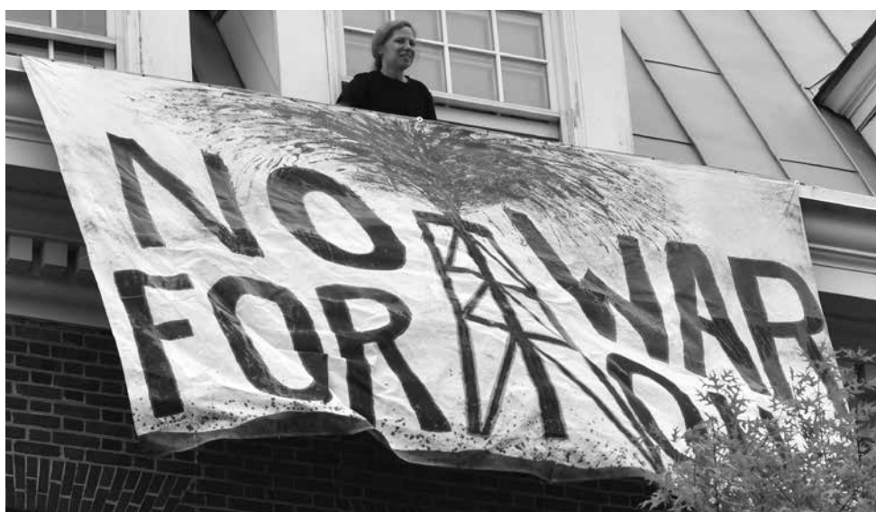
Banner hanging off the roof of the Venezuelan Embassy.