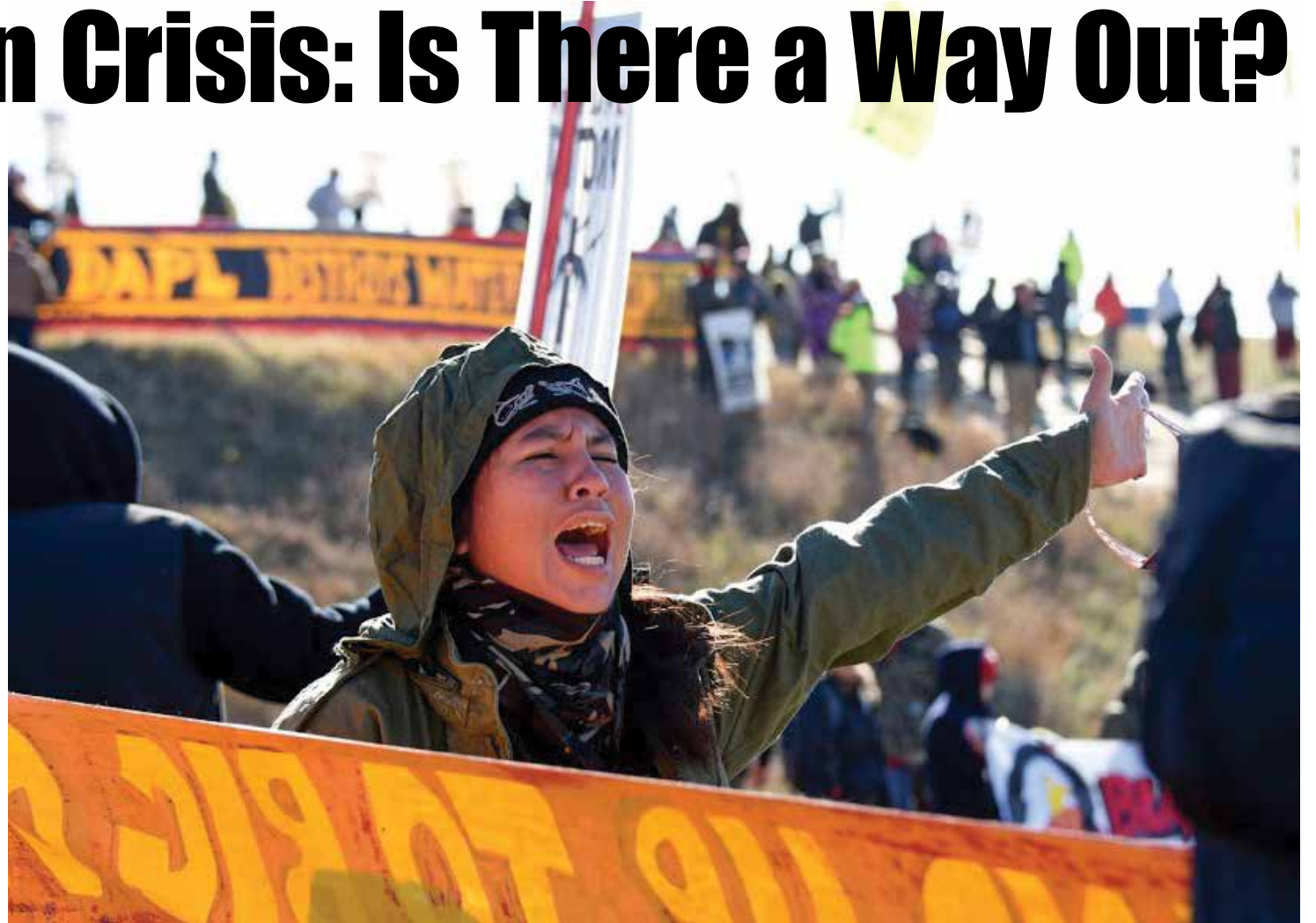
Indigenous water protectors at Standing Rock, N.D., stand against the Dakota Access Pipeline in October 2017.

It is no mere coincidence that the 5% of the global population that are Indigenous are responsible for 80% of Earth’s biodiversity. The summary of the report says as much. Throughout it are references to the importance of Indigenous “paradigms, goals, and values,” along with examples of the “wide diversity of practices” that help nurture biodiversity. There is no denying, the authors write, that the destructive extinction trends, so visible across the planet, “have been less severe or avoided in areas held or man-