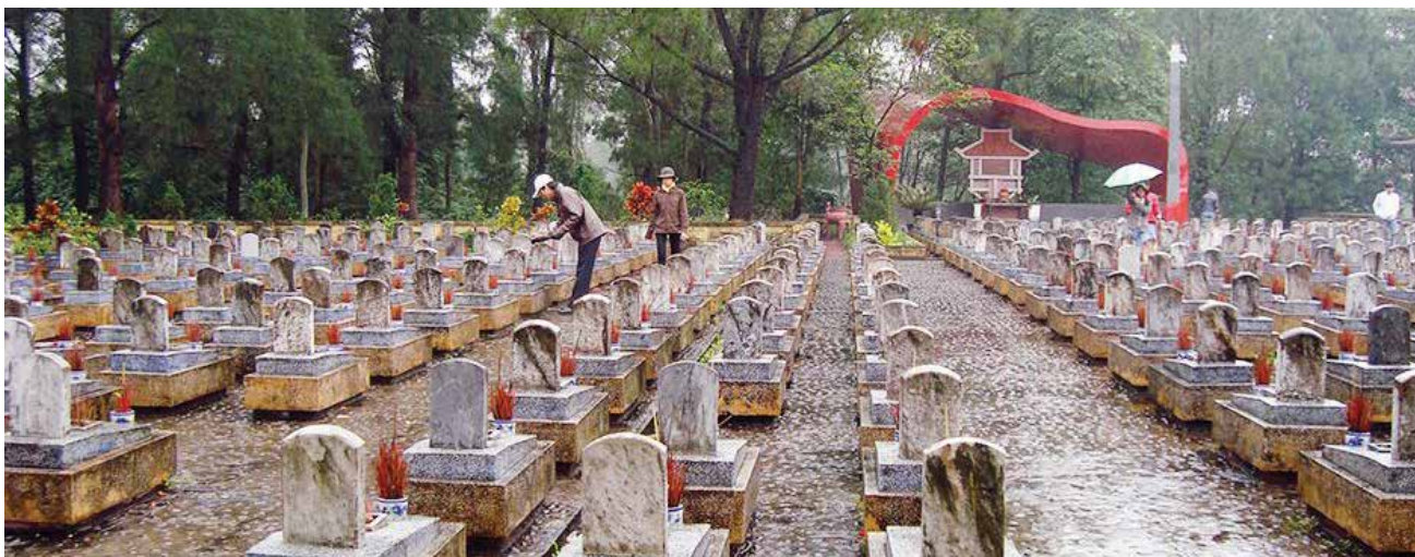
Trường Sơn Martyrs' Cemetery—Quảng Trị, Viet Nam.

Le Ly Hayslip founded two charitable organizations: East Meets West Foundation and Global Village Foundation for humanitarian and emergency assistance in Vietnam and other countries of Asia. She wrote When Heaven and Earth Changed Places which became a motion picture directed by Oliver Stone, and Child of War, Woman of Peace .