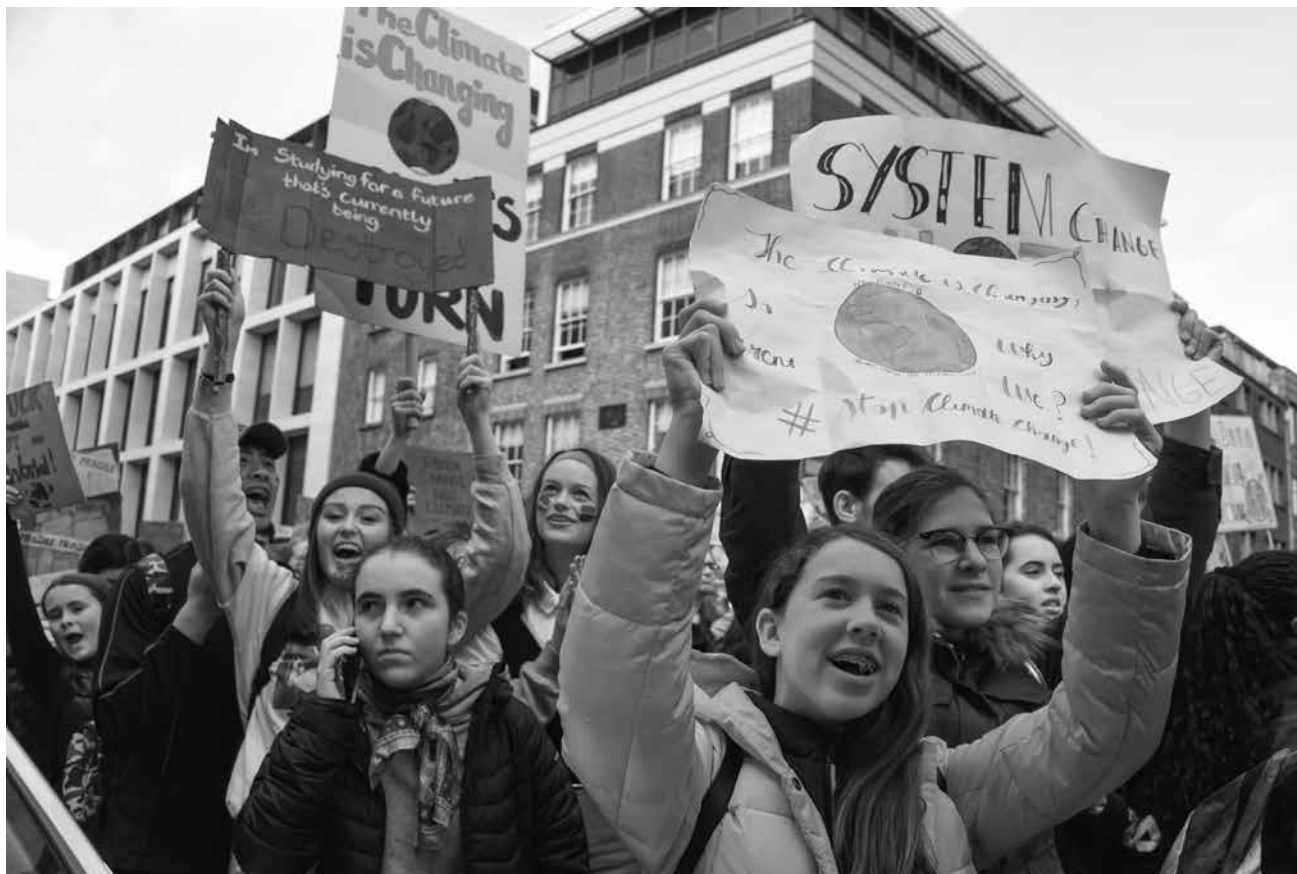
Students in Dublin join the worldwide school strike for climate change, March 16, 2019.