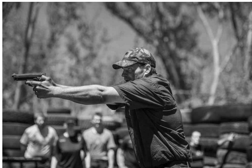
South African militant white farmer receiving training.

For the crime of being modestly responsive to Brazil's Black population, Lula today sits in a jail cell, convicted of corruption charges that are almost certainly exaggerated if not fabricated entirely. Like Gramsci or other famous political prisoners of old, he is permitted limited contact with the outside world, his circumstances similar to that of Julian Assange, who earned the enmity of the global white settler class by exposing the state terrorism that is the rebar of monopoly capitalism's international campaign of dispossession.