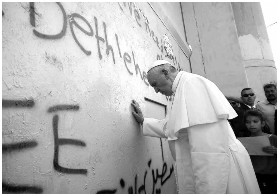
Pope Francis prays in silence at the wall that separates Jerusalem from the West Bank town of Bethlehem (2014).

example, was Leymah Gbowee and the thousands of Liberian women who organized pray-ins and nonviolent protest that resulted in high-level peace talks to end the second civil war in Liberia. The Church has been involved in nonviolent peacebuilding strategies in many coun-