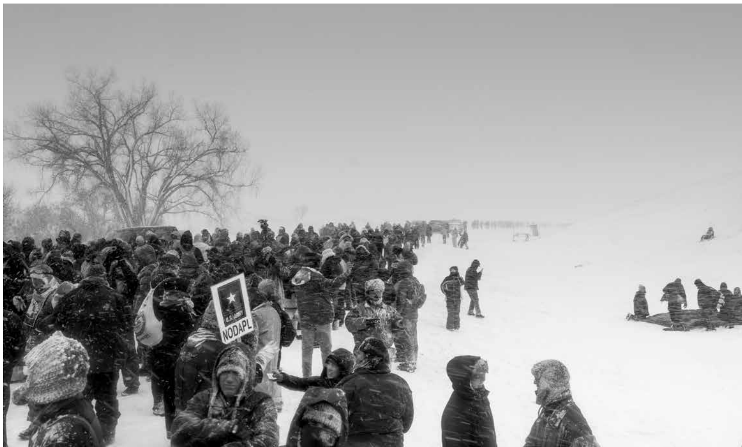
Forty-mile-per-hour winds did not stop water protectors from leaving the comfort of camp to join a peaceful prayer near the barrier on highway 1806.

When we arrived, everyone was in a state of loving appreciation, but with a look of disbelief in their eyes. Did the In-