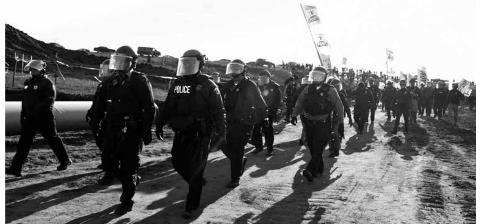
Police at Dakota Access Pipeline protest Oct. 10.