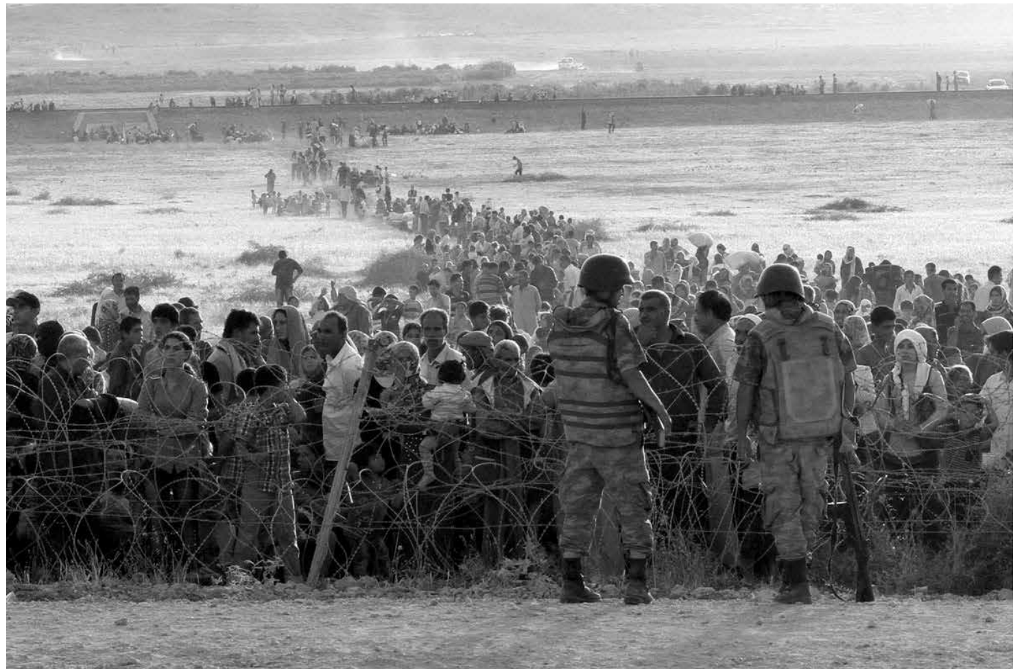
Syrian refugees wait to cross border into Turkey.

The U.S.-led "War on Terror," and its war and occupation against Iraq, led to the destabilization and destruction of several countries, which contributed to the creation of ISIL and to an increase in ter-