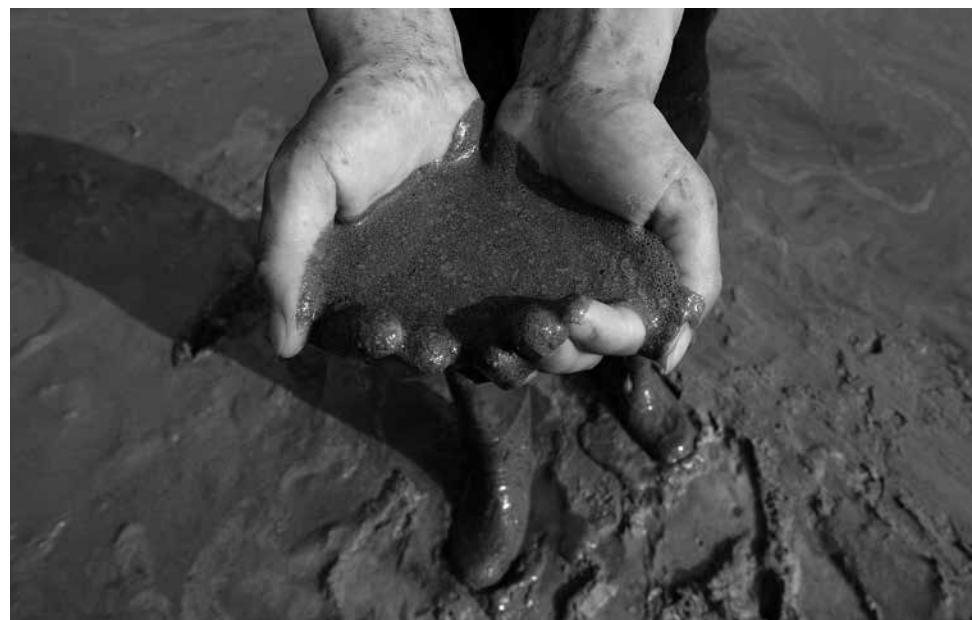
An algae bloom blights Lake Erie.

Wendell Berry was right when he wrote, "We Americans are not usually thought to be a submissive people, but we are. Why