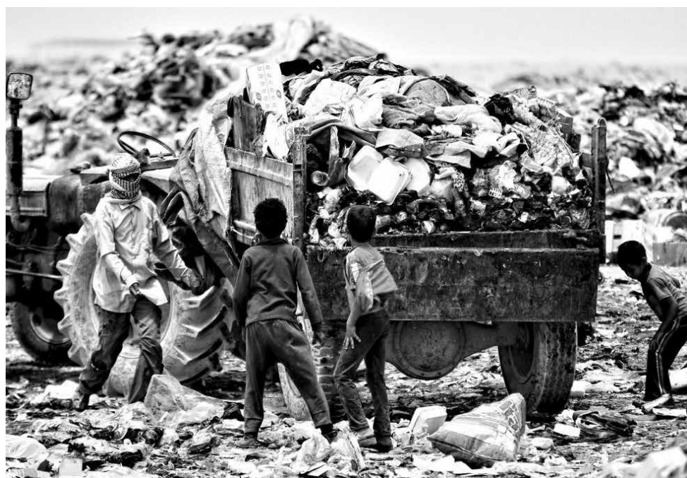
Iraqi children scavenging for recyclables in a dump near Najaf.

unit, with reverse osmosis and ultraviolet light treatment, is set up to clean water from a river, well, or municipal source.