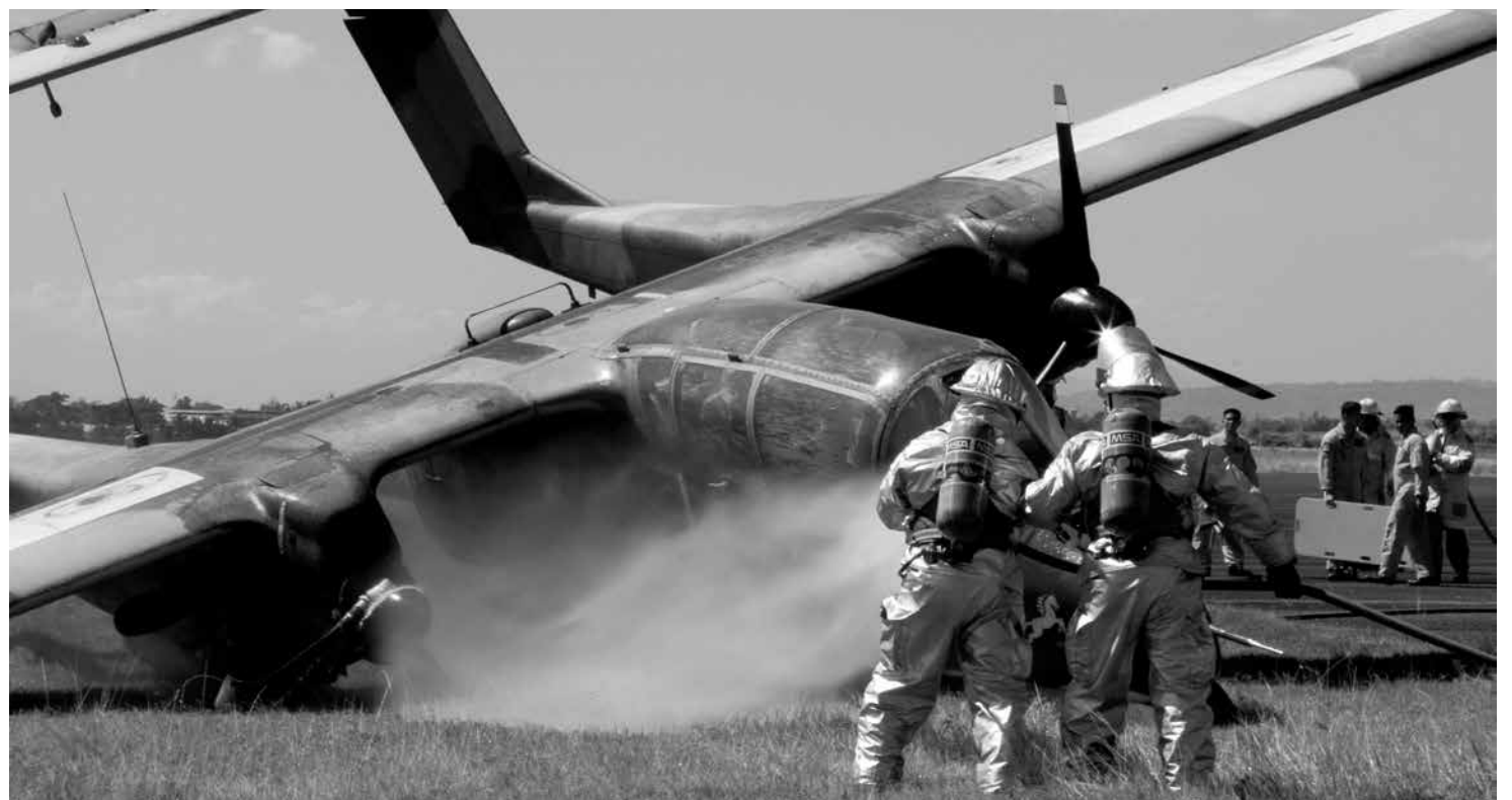
Fire and rescue teams respond to a downed Philippine Air Force OV-10 Bronco aircraft that swerved off the runway upon landing at Clark Air Base.