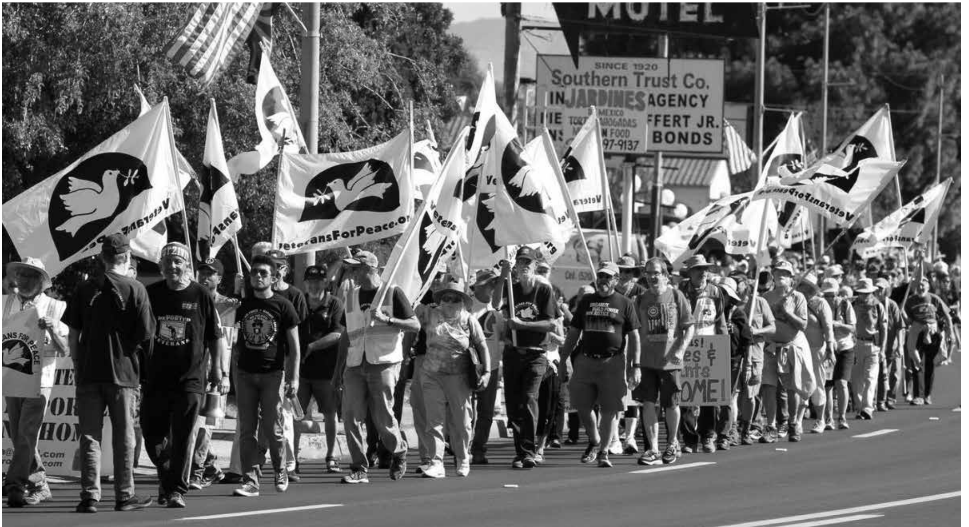
Veterans For Peace leads the march down Grand Avenue in Nogales, Ariz., Oct. 8, 2016.