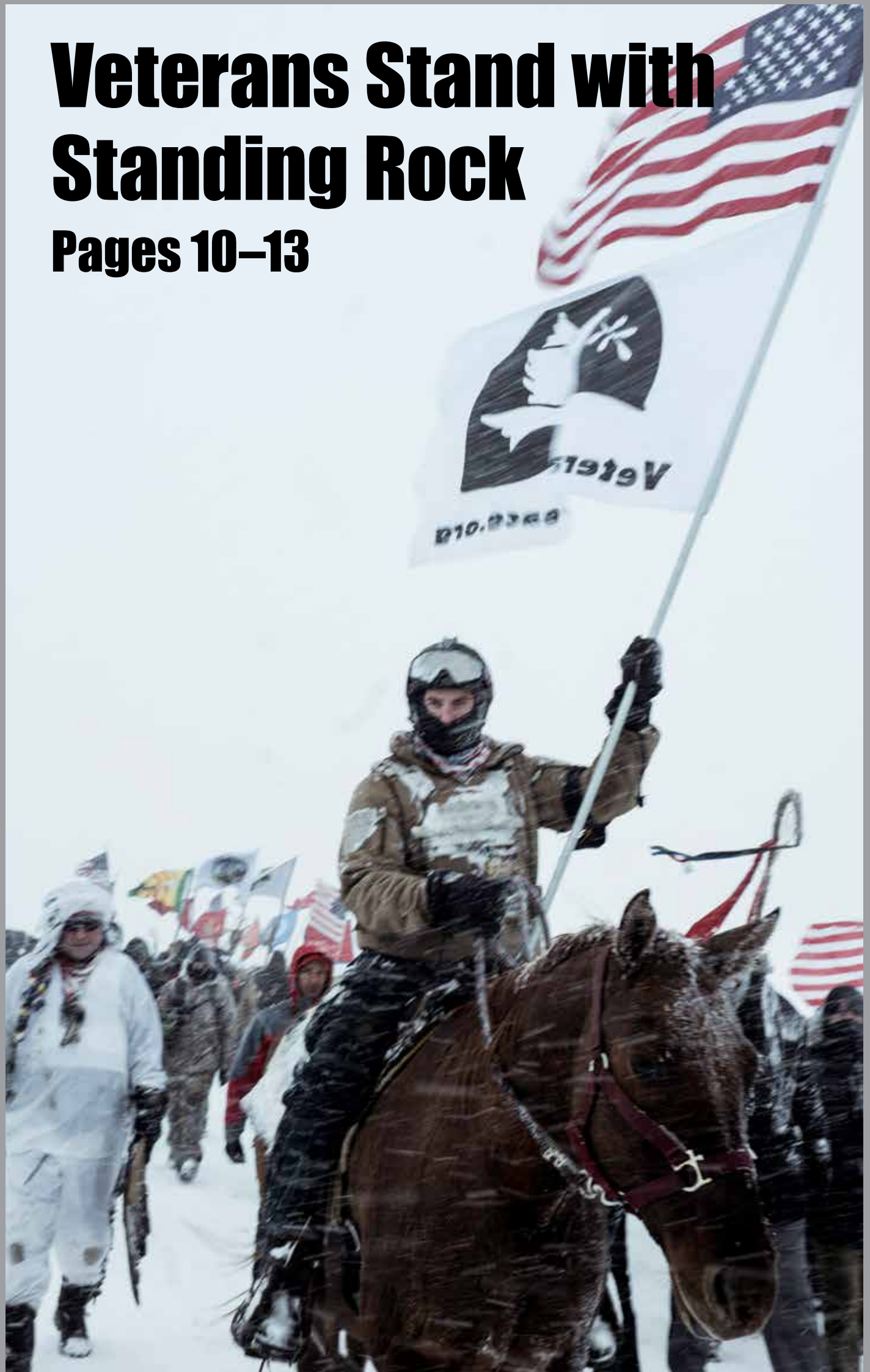
A veteran on horseback leads marching water protectors toward the rope barrier for a peaceful prayer.