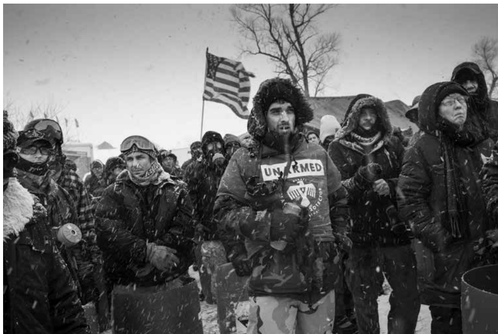
Shield-bearing and chemical mask-wearing veterans are briefed by a Vietnam veteran. He and other veterans remind the group of their peaceful role at the Oceti Sakowin Camp.