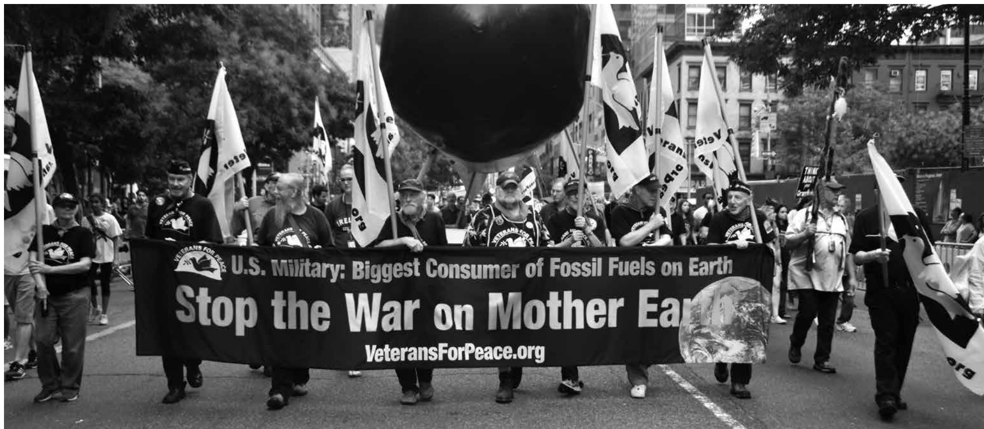
Veterans For Peace at the People's Climate March in New York City September 2014: We are all a part of the struggle to save the planet.