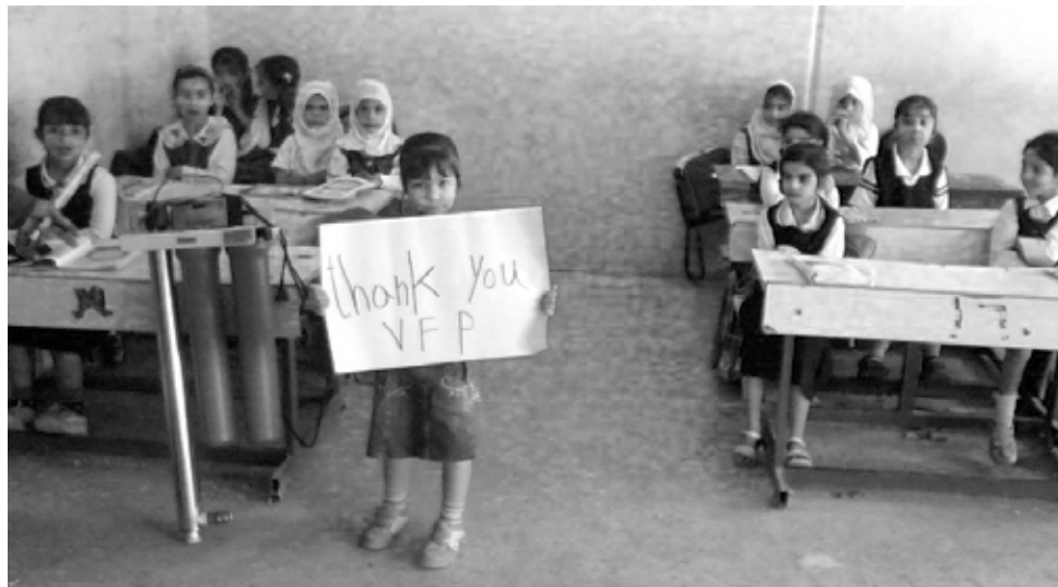
A school in the Therthar village near Falluja.

In 1999 a group of veterans, working through Veterans For Peace, founded the Iraq Water Project with a mission to improve the health prospects of some part of the Iraqi population dependent upon water treatment facilities in desperate need of repair. Once a site is selected, usually a school or clinic, a three-stage filtration