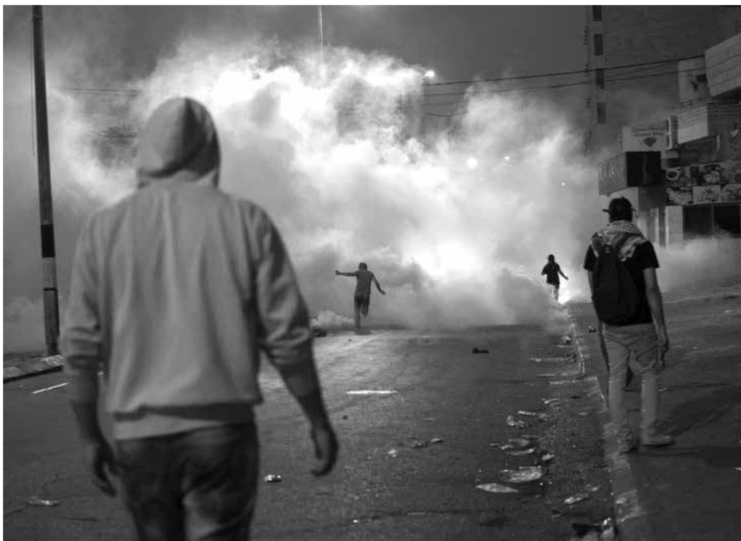
Palestinian protesters stand in a cloud of tear gas fired by Israeli forces during confrontations in the West Bank city of Bethlehem in October 2015.