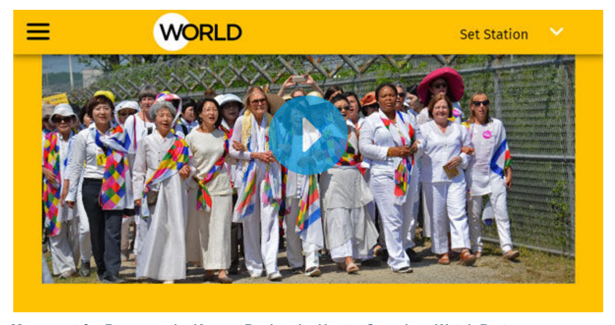
Join the Movement for Peace on the Korean Peninsula: Host a Crossings Watch Party

Crossings , the documentary film that screened at our 2022 convention, which chronicles the extraordinary 2015 peace walk by 30 prominent feminist peacemakers across the DMZ in Korea, will premiere nationwide on WORLD Channel on July 23! The filmmaker and friends are working to get 70 people/groups to host watch parties during the film's 30-day free streaming window , as this is the 70th year since the July 1953 signing of the armistice that ended the hot war.