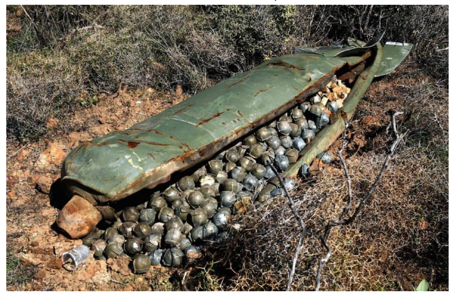
Click on the image to watch a very short clip on the Destructive Power of Cluster Bombs.