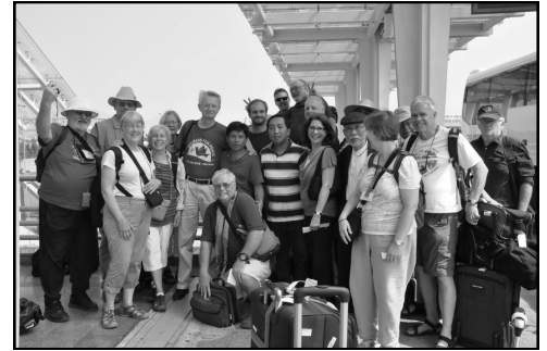
Participants in tour prepare to leave Vietnam