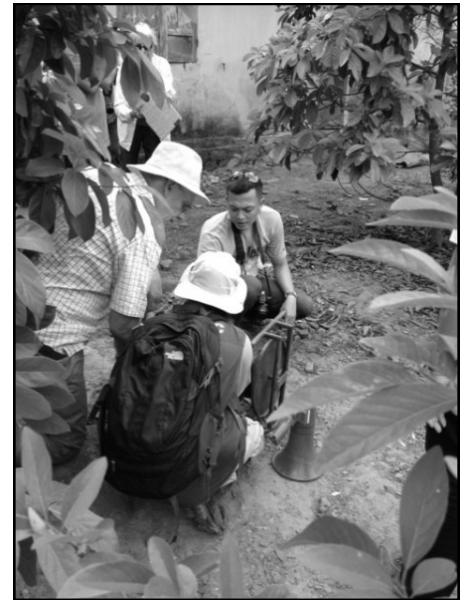
Tour members observe a controlled explosion of UXO in Quang Tri.