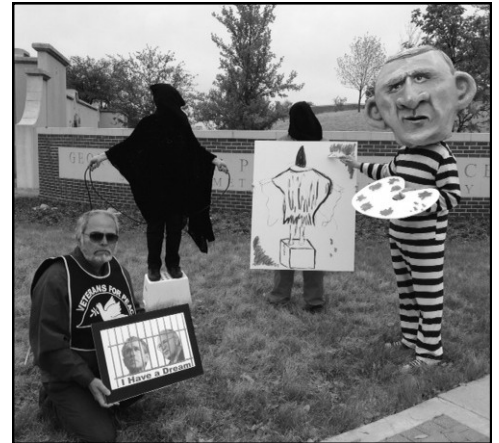
Chapter 106's alternative art exhibition outside the George W. Bush Library

and spelled out "Don't Spy On Us" in lights at the compound entrance. Planning is underway for ALEC's national conference in Dallas, July 30 - August 1.