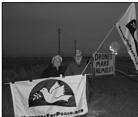
Chapter 69 protests at Beale AFB

We actively support other progressive local groups like Occupy, homeless advocates, the international BDS movement, etc. by endorsing and joining their activities.