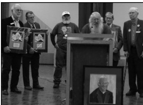
Iowa VFP Chapters receive Bishop Dingman Award