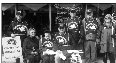
Chapter 168 at the 2013 Veterans Day/Armistice Day Parade

On May 24 we will host a VFP information table at the Louisville BATS Triple A baseball game at Slugger Field on May 24.