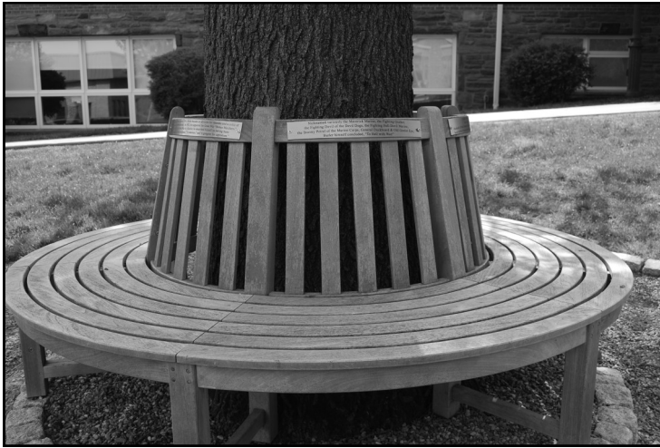
The Smedley Butler Bench at The Haverford School.

The Haverford School is a selective, private, nonsectarian all-boys preparatory school founded in 1884 and located just outside of Philadelphia on the historic Main Line. The School, which from its inception attracted the sons of upper-class Philadelphia families, has historically been the epitome of establishment republicanism, producing representatives of and defenders of American exceptionalism, unregulated markets, and hierarchies of talent and effort. The school's notable alumni include politicians, scholars, industry leaders, writers, artists, and professional athletes, men who shaped their world and left their mark, and all of whom are honored in the halls of this ancient school. All but one. Until recently.