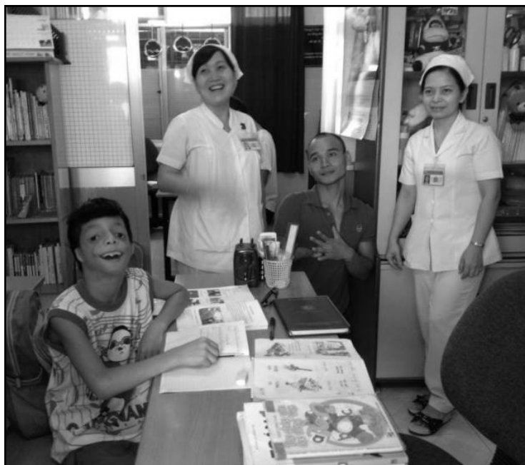
2014 VFP tour of Tu Du Hospital, with young Agent Orange victim.