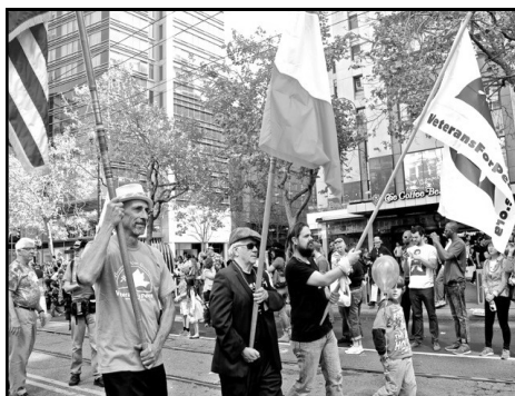
Chapter 69 Flag Contingent in the 2014 St. Patrick's Day Parade