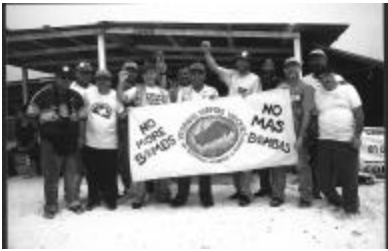
Veterans at bombing site protest camp

Last summer people turned out to see the ships of Operation Sail 2000 as they sailed up the east coast of the United States, the biggest peacetime flotilla ever assembled. It arrived in New York harbor in time for the country's largest Independence Day celebration, including a fireworks show of millennial proportions.