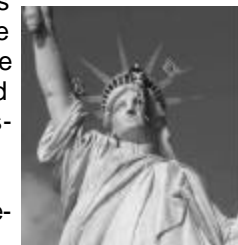
With Liberty and Justice for All

Brown-water sailors in Vietnam's Mekong Delta were sprayed with Agent Orange, which may have saved some lives then, but lost more later.