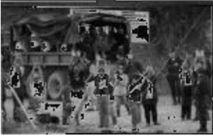
...arrests were made...

Vieques. After local fishermen protested the loss of their livelihood, the Ford administration returned the nearby island of Culebra to civilian use in 1975. Then the Pacific Fleet gave up its 40-year-old combined use facility on Hawaii's Kahoolawe Island in 1980, without compromising its battle-readiness (though the Navy agreed to clean up unexploded ordnance only under Congressional mandate in 1993). The Navy even concedes it can give up the indispensable and irreplaceable Vieques facility - just not yet, not for three more years.